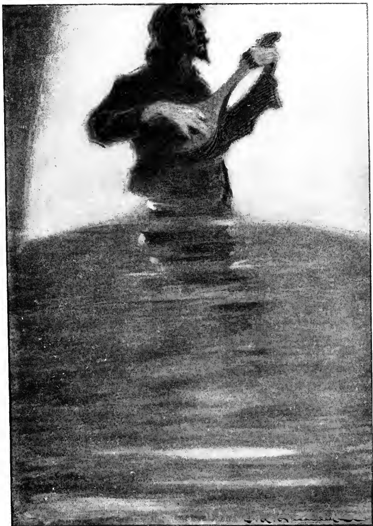
Like a shadow thrown from afar . . . upon a snowy sheet